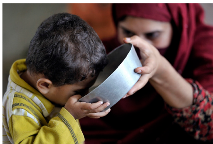
The project aimed to explore men's and women's differing experiences immediately after a crisis. Here a mother gives her child a bowl of clean water in Charsarda District, in Pakistan's northwestern Khyber-Pakhtunkhwa Province, an area severely affected by 2010 floods.

These lessons have been shared with policymakers in both Norway and Pakistan.