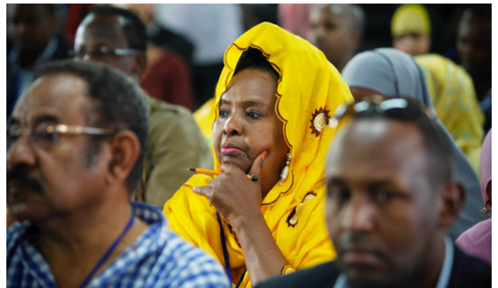
The project examined the current dynamics of women's political agency in Somalia by assessing women's access to and influence in leadership roles in society. Here from a civil society conference organized by the UN Political Office for Somalia (UNPOS), in Mogadishu.

understanding women's agency in patriarchal and non-liberal contexts in new ways.