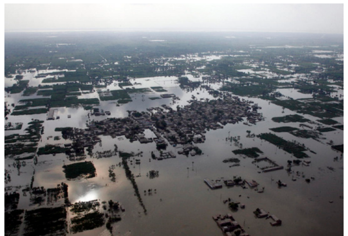
In 2010, devastating floods hit Pakistan's Swat valley. The area was already marred by violent conflict between Taliban and Pakistan's army. 2 million people were displaced by the conflict while 20 million were affected by the floods.

Qualitative research conducted in six villages of the Swat Valley aimed to answer the following questions: how do men and women experience the situation immediately after a crisis?; how can we understand the complex relationship between the desire for personal security and the need for development?; and what part does the gender dimension play in this context?