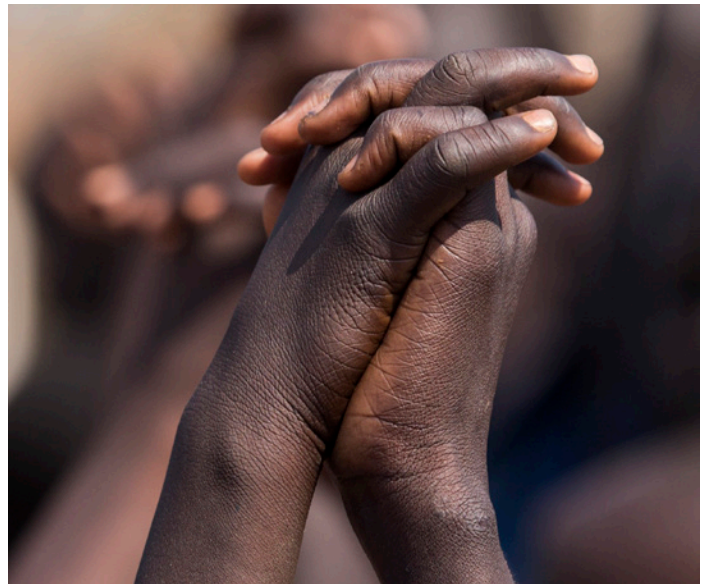
An important finding shows that while Sudan has introduced a series of legal reforms, it has simultaneously oppressed an emerging independent women's movement in the country.

child resists or not. In reality it is a matter of luck whether a girl meets a judge that applies 18 years or signs of puberty as definition of adulthood.