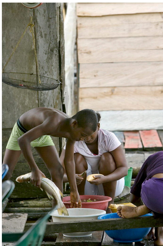
The case study of the Liga de Mujeres Desplazadas showed how the Liga proactively used research to advance its own agenda in interactions with government and donors. 2 million people were internally displaced during the violent conflict in Colombia, here an IDP family in Rio Sucro.

of women's political activism in a violent context. Political organization can be a response to gendered violence, and gendered violence can constitute an obstacle to organization. Looking towards a Colombian peace, a widening of the scope of attention also invites complex reflection on the possibility of transformative reparations in post-conflict situations.