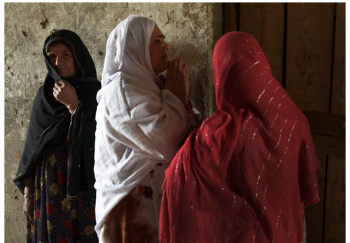
The main questions for this project have been: what is the role of women in processes of local community councils in Afghanistan, and how is violence against women treated in state institutions?

At village level in Afghanistan, important decisions centre around resources, particularly distribution of resources flowing into the locality through aid programmes and local land ownership. Decisions on such matters are generally presided over by 'traditional' elites; powerful families with land holdings and claims of being the original settlers of the area or of noble religious lineage. After 2001, new formal structures were set up, such as