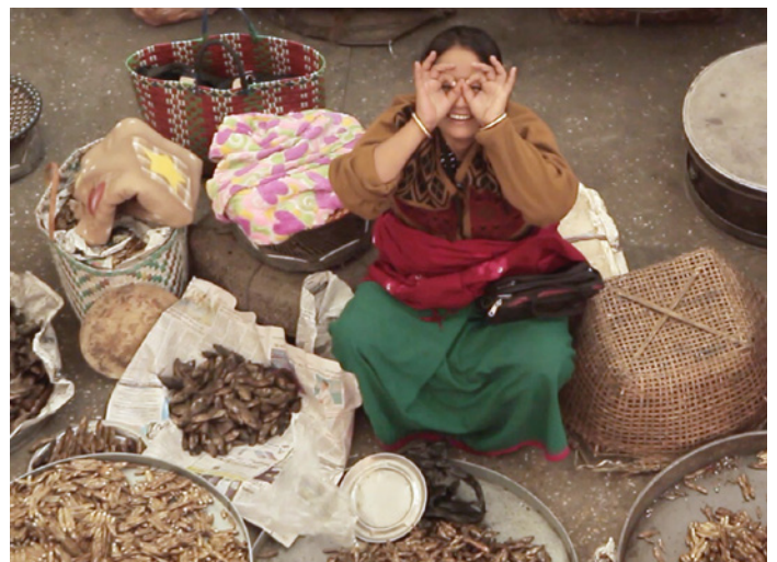
The project studied local understandings of gender equality, disempowerment, empowerment and political participation in conflict as well as in peacebuilding. Fieldwork was conducted in northeast India, in several states. Here from the Mothers' Market in the northeastern state of Manipur. The market is run and managed entirely by women.

The question is whether and how women's presence in political debates should be achieved.