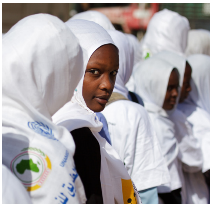
An important recommendation from all projects is that governments and aid donors must learn from local women’s movements. Support for an independent women’s movement, in both post-conflict and non-conflict settings, is vital for introduction and implementation of reforms and policy changes. In Sudan, in North Darfur, women and girls march to celebrate International Women’s Day on March 8th.

the ‘global agenda’ might be necessary. For instance, NGOs and the UN cannot afford to engage a-religiously in societies where religion plays a dominant role.