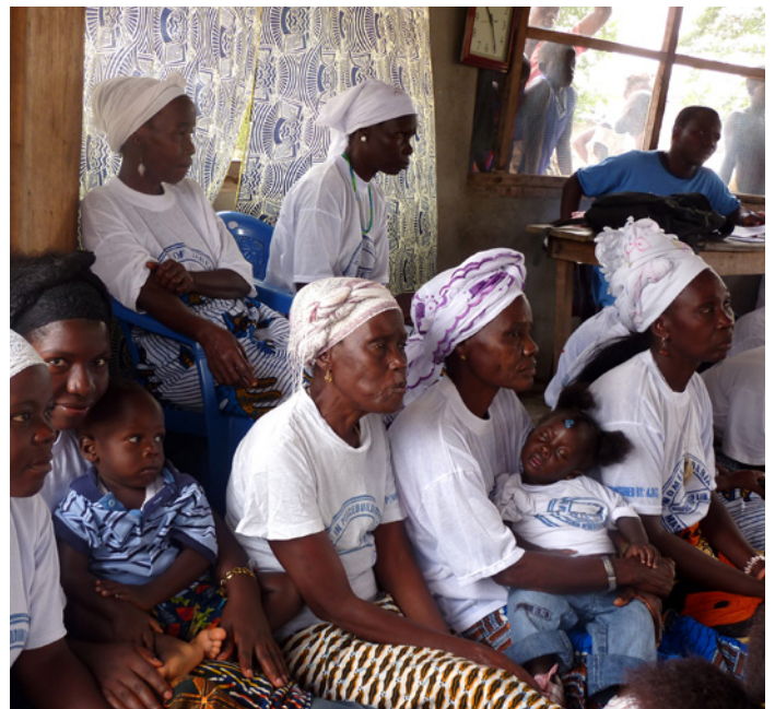
The project examined customary Liberian courts that play an important role in rural Liberia. Here a picture from a «peace hut», a women-run community court serving to resolve domestic disputes and dispense informal justice in Liberia.

Reducing sexualized and gender-based violence has been one of the major goals of the United Nations Mission to Liberia (UNMIL). Before the wars, a considerable number of anthropological studies were conducted on the topic of Liberia's traditional justice system. This project has aimed to examine how the traditional systems work in the post-war context when it comes to the problems of gender-based violence. The research results are based on two main fieldworks in Nimba County and Grand Bassa County.