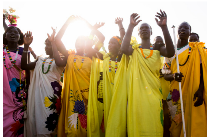
The project looks at legal definitions of rape in an Islamic state (Sudan), and women's fight for reform. Women leaders in Malakal, Upper Nile State, South Sudan.

in Darfur. This politicization has led to branding of women activists as enemies of the state.