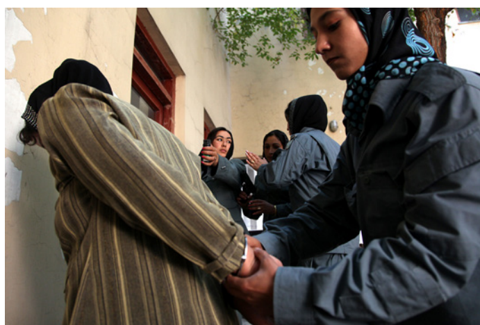
Research on local governance showed that aid interventions had increased participation of women, but it was dependent on male support and largely reproduced 'traditional' forms of governance. Here policewomen from the Afghan National Police train at a police training centre in Kabul.