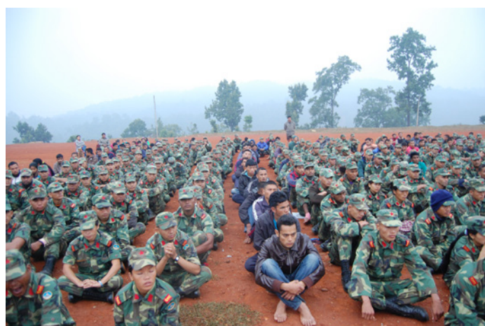
The project is ongoing, but preliminary results from Nepal reveal that many female ex-combatants have experienced relatively good gender equality within the Maoist movement, and their problems began when peace came.