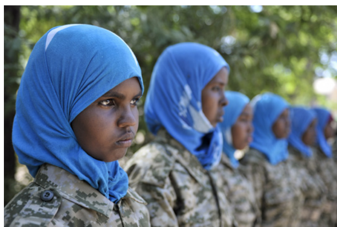
Female Somali National Army (SNA) soldiers stand at attention at a camp in Belet Weyne, Somalia. The outcome of the project with the greatest transformative potential is that it has created female role models through creating networks, recording stories and presenting a film.

higher education institutions, formal and informal businesses, and NGOs.