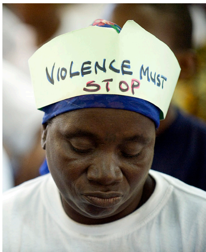
The project aimed to gain a better understanding of the situation for women affected by gender-based violence in Liberia and their access to justice. Here from a campaign meeting launched by the UN Mission in Liberia to strengthen the rights of women and stop gender-based violence.

Donors and aid programmes should recognize the weakness of the Liberian state, and take a more pragmatic approach that takes into account the role that customary courts play for most Liberians.