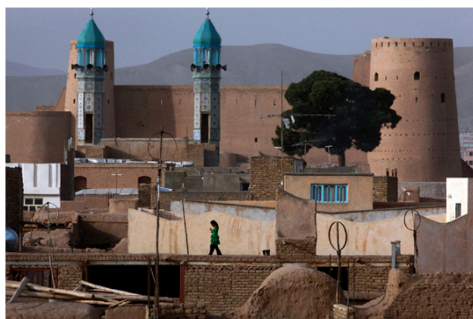
A young girl walks across rooftops in Herat, Afghanistan. In this urban province the number of cases on violence against women that were brought to court were high-62 per cent.

local factors affecting the judicial treatment of gender-based violence.