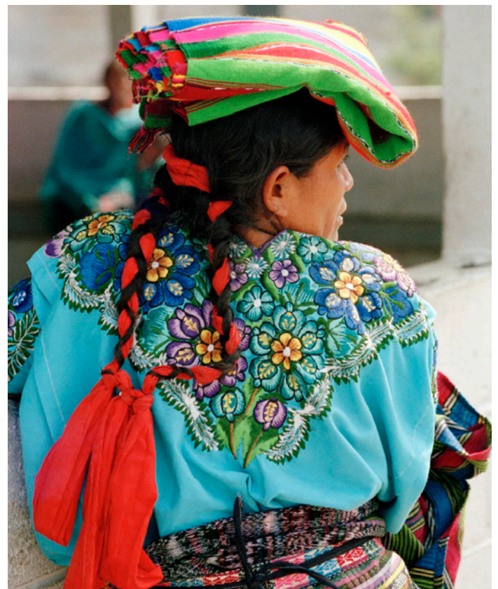
The project explored indigenous women's access to justice and security in Colombia, Mexico, Ecuador, Bolivia and Guatemala. A Mayan woman from the Quiche region of Guatemala wears here traditional attire.

Policy discussions often tend to assume that group rights are bad for women and that individual, liberal conceptions of human rights are always beneficial. To examine this argument empirically, this project has carried out ethnographic studies, focusing particularly on the organizing of indigenous women for justice and security, and the gendered outcomes of these processes.