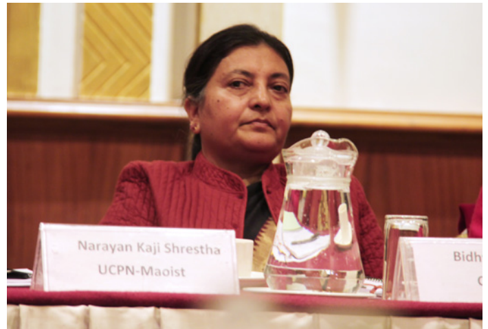
During the process of transition and social reconstruction, women achieved unprecedented representation in constitution making in Nepal. In 2015, Bidhya Bhandari from the Communist Party of Nepal was elected as the first female president in Nepal.